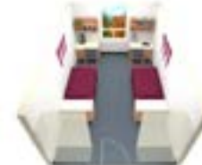
Double Room, 2 twin beds $114-$128