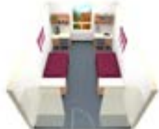
Double Room, 2 twin beds $124-$128