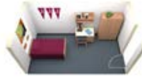
Single Room, 1 twin bed $70-$75