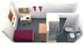
Single Room, 1 twin bed $88