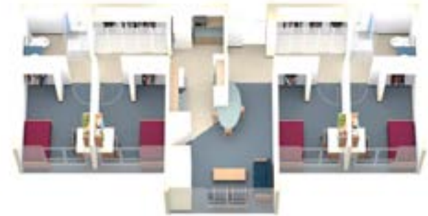
Single Room, 1 twin bed, 1 room 1 washroom (shared) $295.