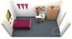
Single Room, 1 twin bed $68-$70