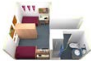
Double Room, 2 twin beds $137